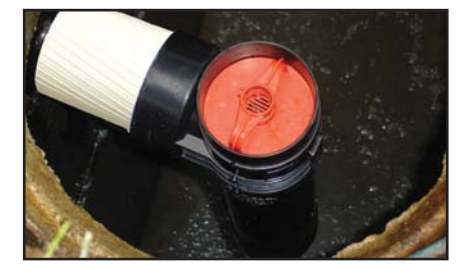
With PL-68 Filter & Tee