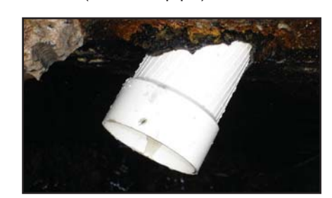
After (4" Extend & Lok™)