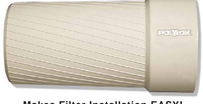
Makes Filter Installation EASY! Easy to install in hard to reach places.