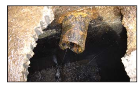
Before (cast iron pipe)