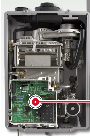
PC Board and Controller

Integrated Condensate Trap to remove acidic condensate