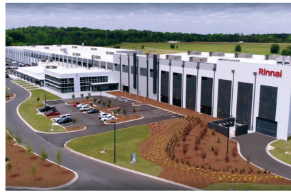
Rinnai America in Griffin, Georgia, USA

Rinnai continues to make significant investments in expanding its operations and product portfolio, focusing on its brand promise of Creating a healthier way of living®