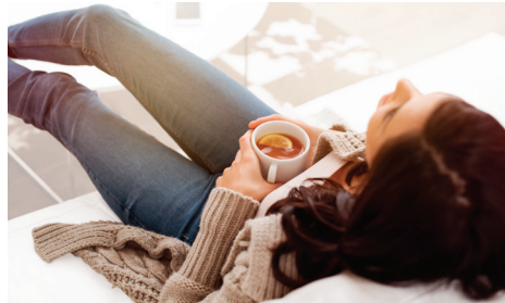
Home Heating Solutions