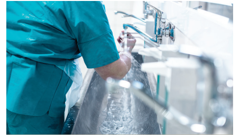
Commercial Water Heating Solutions