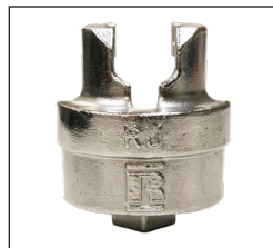
Model RJ Wrench