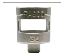
Model G6 Wrench