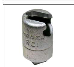
Model RC1 Wrench