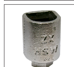
Model ZX-HSW Wrench