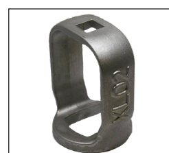
Model XLO2 Wrench