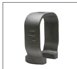
Model W1 Wrench