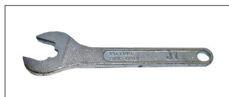
Model J1 Wrench