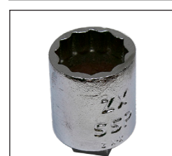
Model ZX Wrench