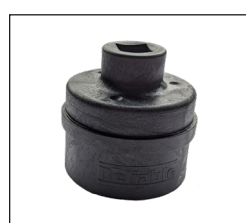
Model W8 Wrench