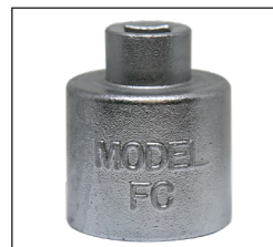
Model FC Wrench