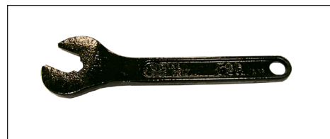
Model F3R Wrench