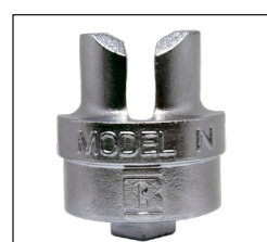
Model N Wrench