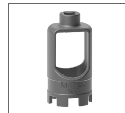
Model W10 Wrench