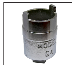
Model G4 Wrench