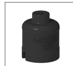
Model W11 Wrench