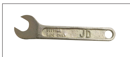
Model JD Wrench