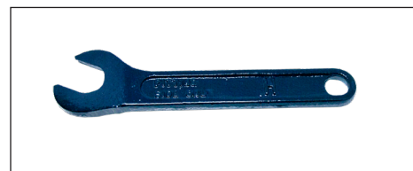
Model H Wrench