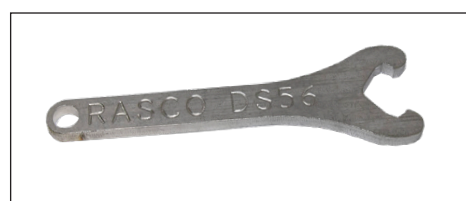
Model DS56 Wrench