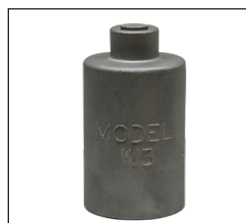
Model W3 Wrench