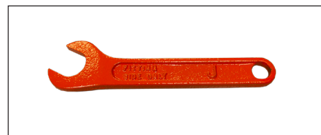
Model J Wrench