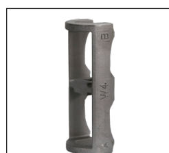
Model W4 Wrench