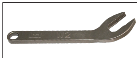
Model W2 Wrench