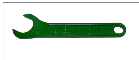
Model JV Wrench