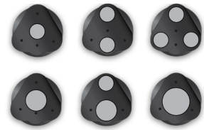
Multiple Configuration Options