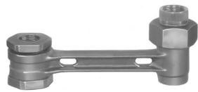
BA-22-MO MUELLER METER BAR Sleeve Inlet, FIP Wedge-seal® Insulated Union† Top Outlet with O-Ring