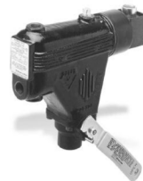
Model 67-LQHU (without quick hook-up fittings)