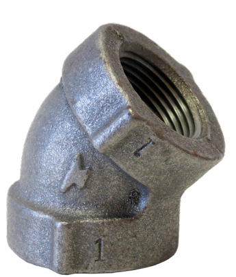
Fig. 356R 45° Reducing Elbow