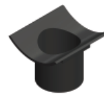
T300-PBO 2" No Hub Bottom Outlet