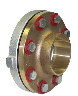
Pictured: T-571NL (4")