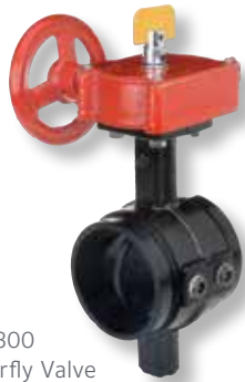
BFV-300 Butterfly Valve