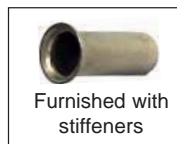
Furnished with stiffeners